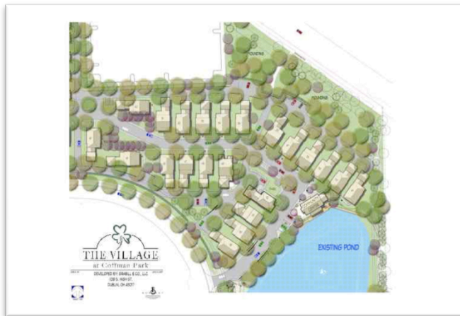
Master Plan Rendering