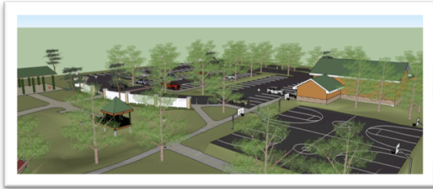
Park Entrance Rendering