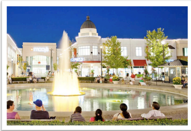
Central Park Fountain

Client: Georgetown Properties Engineers Estimate: 2.0M