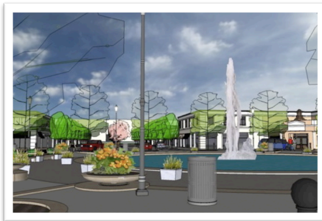
Central Park Fountain Rendering